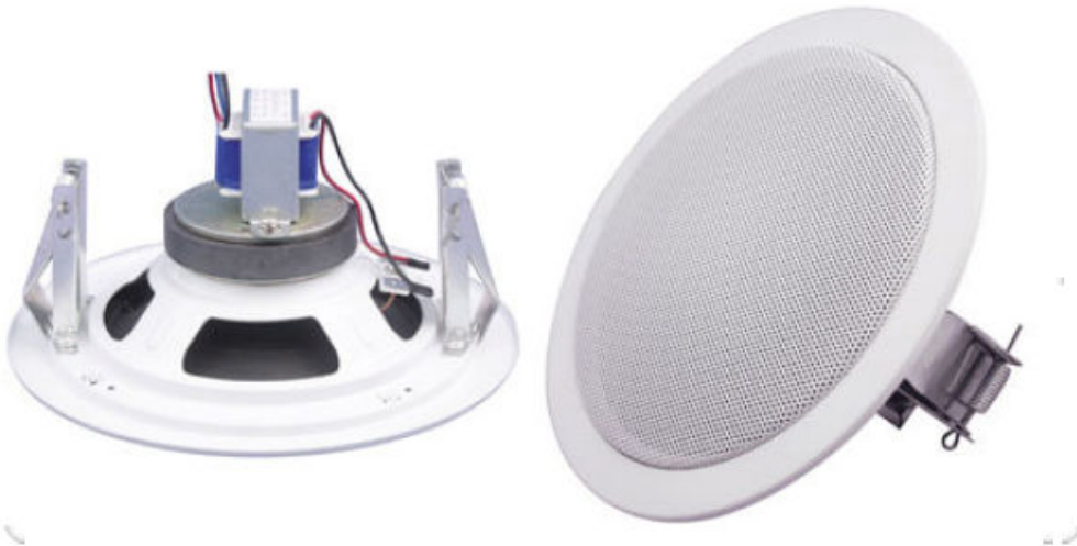
Model : HSR153-5T